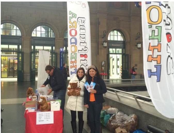
Visiting SCCT Member Theodora Foundation at Zurich Central Station