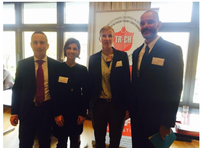
SCCT participating in Switzerland Global Enterprise - Impulse Event Europe in Zurich