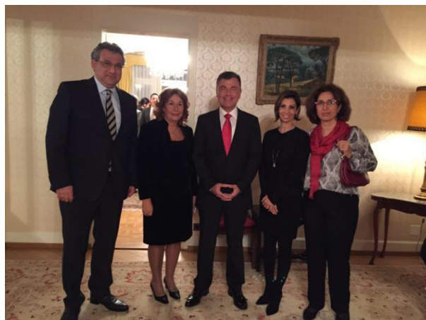
Turkish National Day Celebration at the residence of the Ambassador of Turkey in Berne